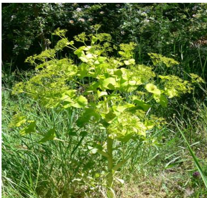
Figure 1. Assessment and general view of Smyrniium galaticum .

Habitat: Stony rocky places, in open forest.